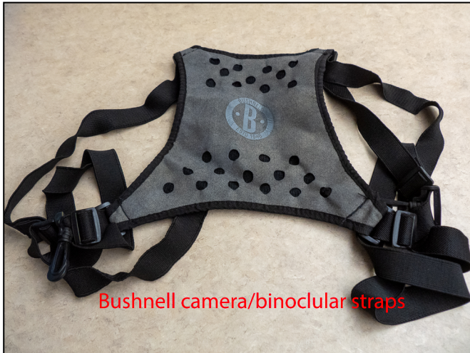
Bushnell camera/binocular straps