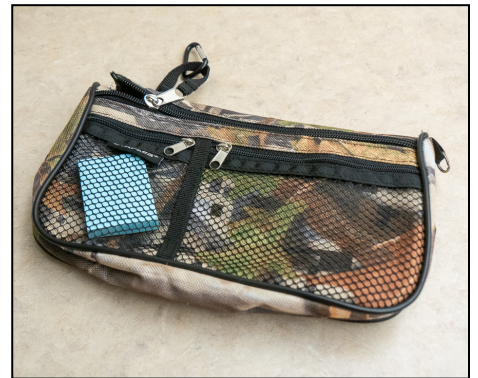
Accessory Bag - Best Offer