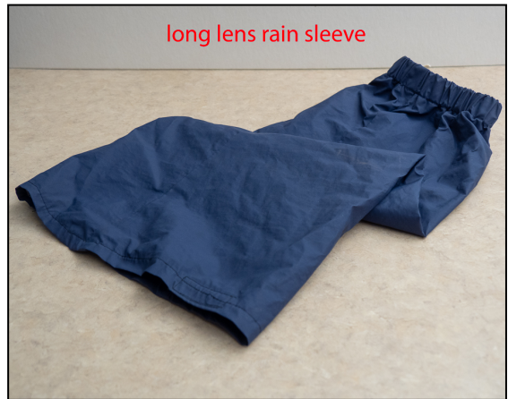
long lens rain sleeve

Camouflage Shirt, Ladies Small-Medium — $25