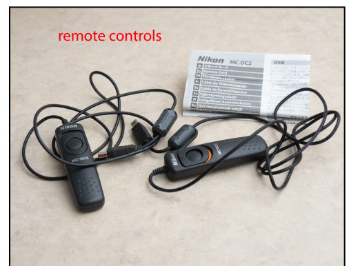
Remotes (2) - $20 each