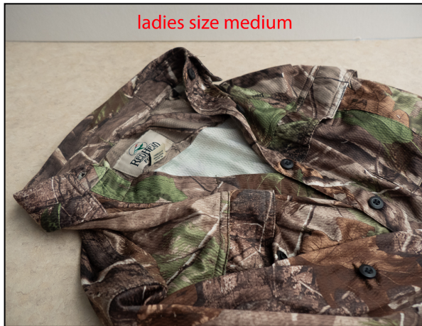
ladies size medium

Camouflage Shirt, Ladies Small-Medium — $25