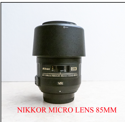
NIKKOR MICRO LENS 85MM