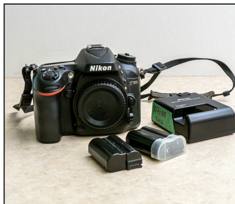
D7100 Camera Kit - $449