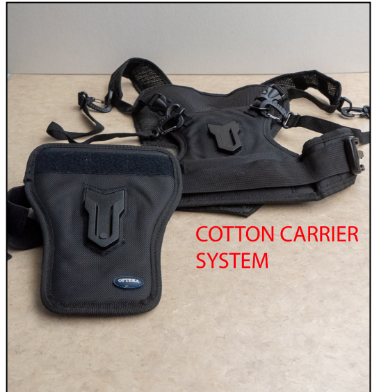
COTTON CARRIER SYSTEM