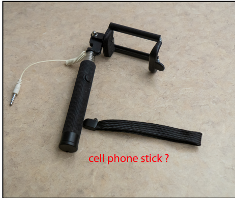
cell phone stick?