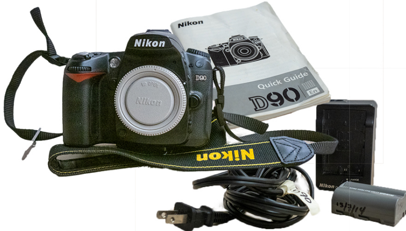
D90 Camera & Accessories- $259