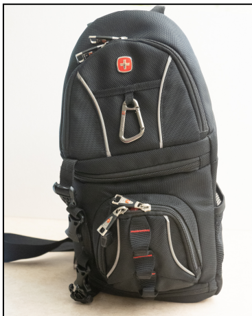
Camera Sling Bag - $35