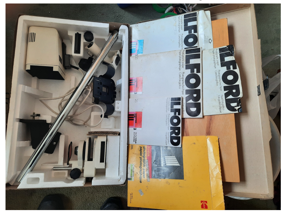
Enlarger. Box. Inside